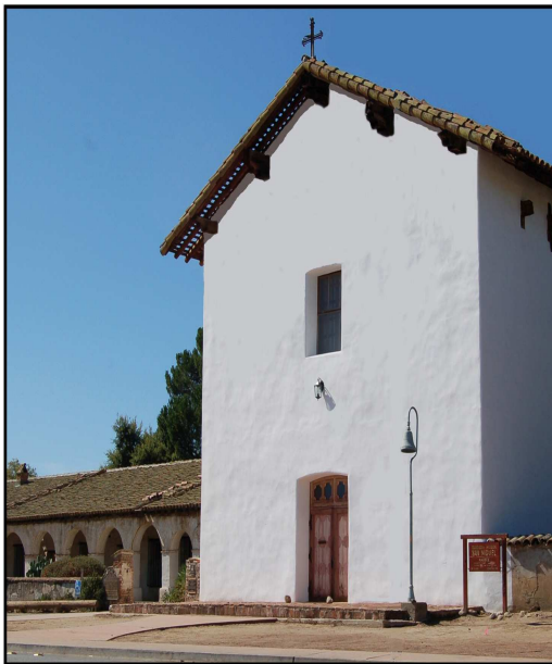
Mission San Miguel Arcangel - 1797

Sunday 9:00 am English Sunday 10:00 am Spanish